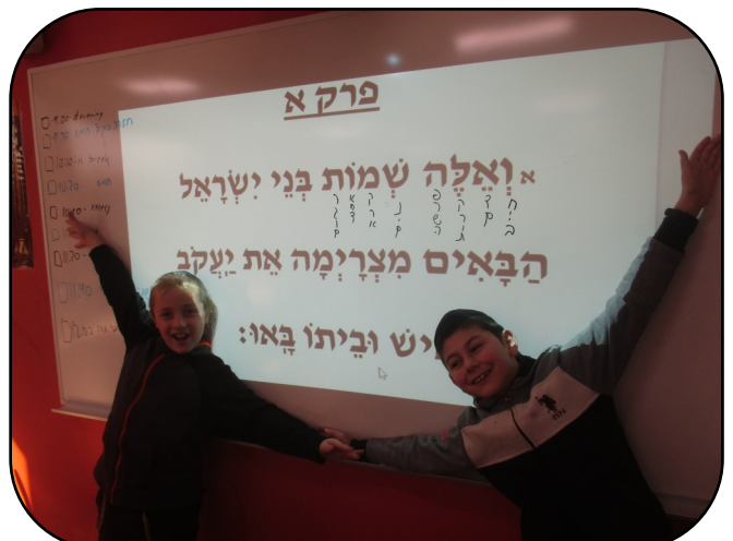
4th grade celebrating their joining the Shnayim Mikra program with a ראשי תיבות in their vey own פרשת שמות!