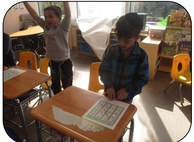
שורשים enjoyed a fun bingo game to review their כּתּה א'