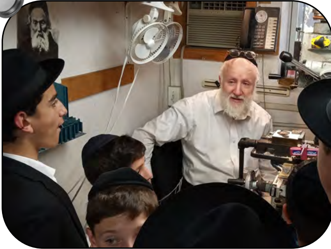
7th Grade visit to a Battim Macher!