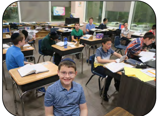
'shteiging despite a super storm outside!