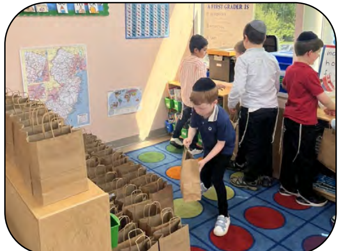
1st Grade packing Shabbos peckalach for the Buddy Bench Project!